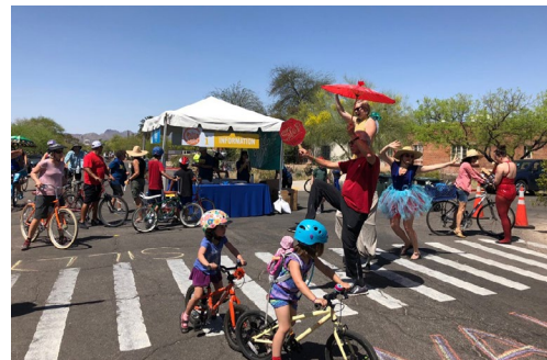
Rincon Heights Activity Hub 2018: Bringing Cylovía fun out to the neighborhood streets

Speaking of biking, we're also thrilled to announce that Cyclovía Tucson is returning to the Lost Barrio — Himmel Park route this spring (Sunday, April 16, from 9am-3pm) and is running through our neighborhood. Cyclovía is a like a 3-mile-long block party where people can walk, bike, roll, connect, and play in car-free, care-free streets. There will be lots of fun activities for all ages, music, food trucks, and free bike repair stations to choose from. Rincon Heights will once again host an Activity Hub on 9th Street and Martin Avenue to add to the festivities during the event. Please contact Evren at evren.sonmez@gmail.com if you'd like to volunteer for an hour (or more) to help out at our activity station and enjoy seeing all the big Cyclovía smiles. Either way, we hope to see you out there! More info can be found at cycloviatucson.org .